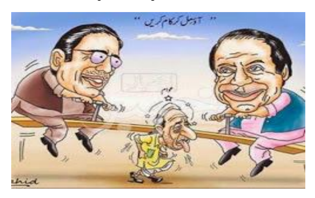
"Politicians are the POISON, not the Antidote"

Financial infirmity disturbs all fields of life, this is where our country has suffered due to these muggers, who have built their empires abroad with the looted national exchequer of the poor Pakistanis.